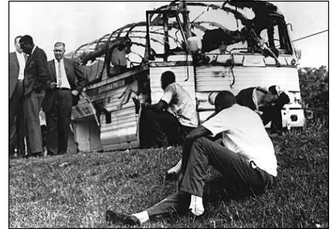
Freedom Riders sit by their bus which had been burned by a white mob in Anniston, Alabama. Freedom Riders began traveling through the South in 1961 to try to desegregate Southern bus stations.

"I see America through the eyes of a victim. I don't see any American dream. I see an American nightmare."