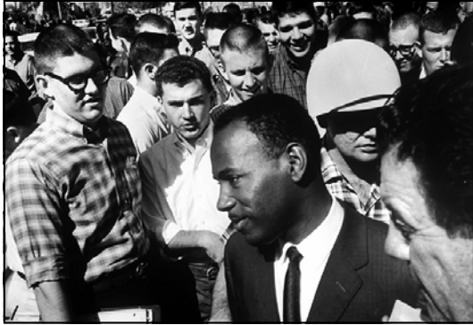
James Meredith, the first African American to be admitted to the University of Mississippi, being escorted by US Marshals as he is harassed by onlookers.

Examine the pictures and captions from the Civil Rights movement below. What is happening in each of these pictures? What do you think these people are thinking? What do you think they are saying to each other? What do you think they will do next? With a group, choose one of these six pictures and write a scene that brings the image to life.