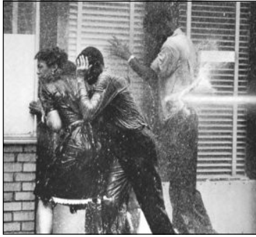
Black protesters being sprayed with a high-pressure hose in Birmingham, 1963.