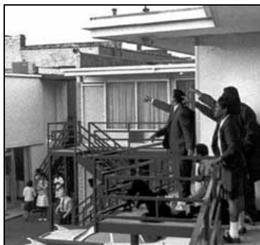
Just moments after Dr. Martin Luther King, Jr. is shot, bystanders indicate where they believe the shot came from.