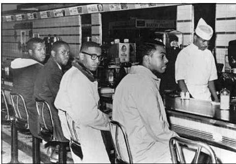
In 1960, four black college students walked into a Woolworth store in Greensboro, NC, and sat down at the lunch counter, which was for white customers only. For the next six days, a growing number of students joined the sit-ins until Woolworth closed its doors.