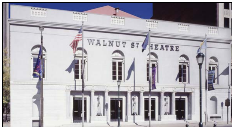
Visit Walnut Street Theatre, a National Historic Landmark, on the corners of 9th and Walnut in Philadelphia

Over the years audiences have clapped and cheered for circus, opera, vaudeville, lectures, music, dance, motion pictures, and of course, the live theatre productions for which it is best known today. When the theatre opened its doors on February 2, 1809, the pounding of hooves mingled with the shrieks of delight from the crowd as teams of horses circled a dirt riding ring. A few years later, an 80-foot dome was added to the theatre, making it the tallest structure in Philadelphia at that time. The theatre's career as an equestrian circus did not last long, however, and by 1812 the building had been converted to a legitimate theatre, featuring a real stage where the ring had stood. The Walnut's first theatrical production, The Rivals , had President Thomas Jefferson and the Marquis de Lafayette in attendance on opening night.